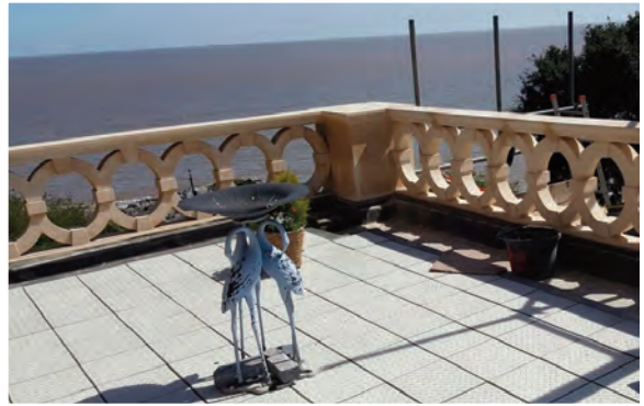
Photos of Woolf Institute, Harvest House Balcony and Lloyds Bank