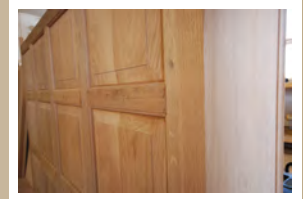
Photos: A new oak staircase for Westminster Abbey (top left), oak storage units for St Marys Islington (top right), new sepele sash casement double glazed windows for Marygolds Barn (bottom)