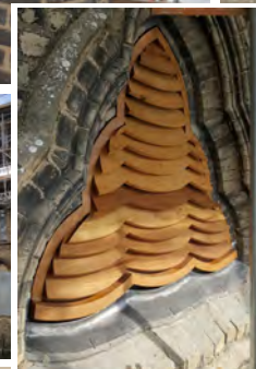
Photos: St Johns the Evangelist, a new spirelet (top left), and the new louvre (bottom right)