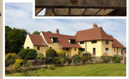
Top photo: Hand-cut oak timber frame roof