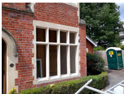
Top photo: St Andrews Church, Impington hoodmould and tracery